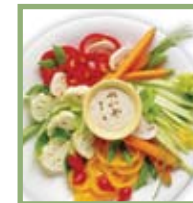
dressings, dips & salsa