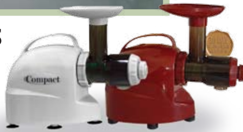
Available in Ivory or Burgundy