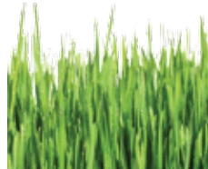
wheat grass juicer