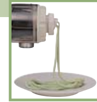
pasta & noodle maker