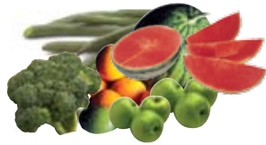
fruit juicer & vegetable juicer