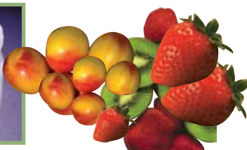
frozen fruit, desserts & sorbets